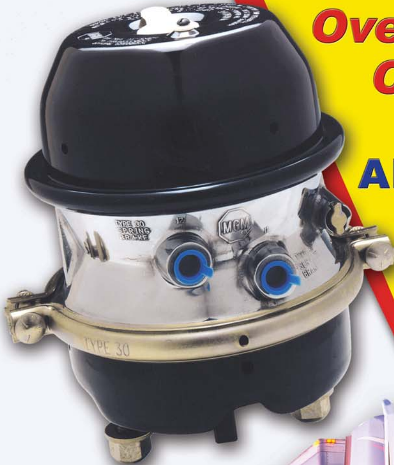
TR-3030 Model Shown

Overwhelming Choice of NORTH AMERICAN Truck & Trailer OEMs