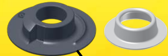
“New” composite guide Note: guide is depicted in orange for visual purposes. Patents Pending.

The new spring guide also ensures precise alignment of the power spring inside the brake. Accurate alignment of the head side of the power spring compliments our patented Center-Hole Diaphragm (CHD) design providing longer center seal and power spring life.