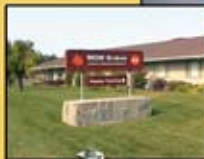
Above: MGM Brakes Manufacturing Plant, Murphy, North Carolina Left: MGM Brakes Manufacturing Plant, Cloverdale, California