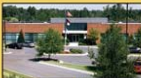
Top: IHG Corporate Office Right: MGM Tech Center, both in Charlotte, North Carolina Below: R&D never stops at MGM Brakes.