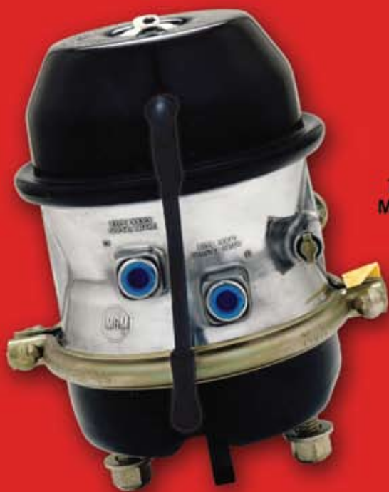
TR-LP3THD Model Shown

PROVIDES EXTRA PARKING FORCE WHEN YOU NEED IT MOST.