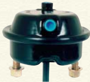
CS16LH (shown) Totally sealed

Note: All dimensions shown in inches and are subject to design change.