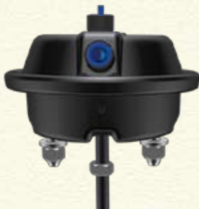
CS16LH (shown) Totally sealed

Note: All dimensions shown in inches and are subject to design change.